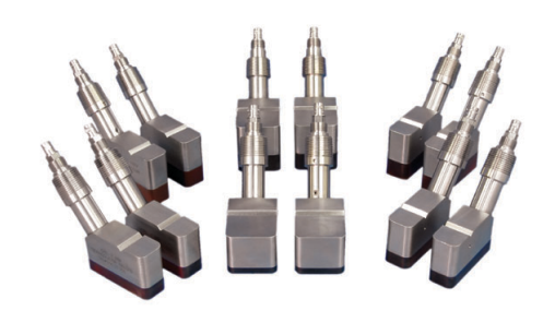
GE technologically advanced clamp-on gas ultrasonic transducers