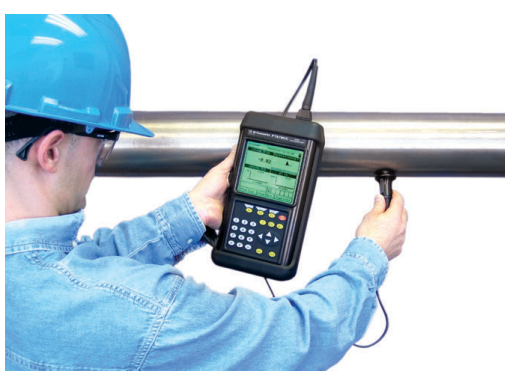
Optional pipe wall thickness gauge

Pipe wall thickness is a critical parameter used by the TransPort flowmeter for clamp-on flow measurements. The thickness-gauge option allows accurate wall thickness measurement from outside the pipe.